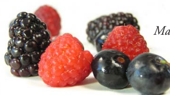
Maturitas. June 9, 2009.

Future research will help us understand more clearly the role that specific foods and dietary supplements play in brain health and overall health.