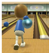
Wii Bowling