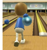
Wii Bowling